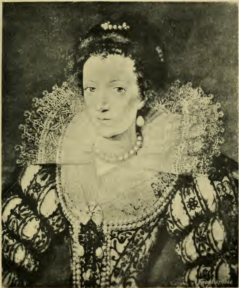
ANNE OF AUSTRIA